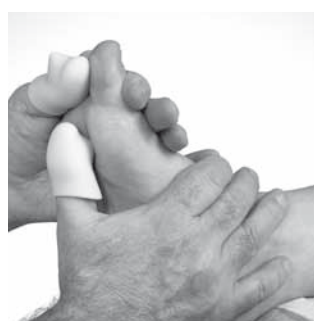
FOOT REFLEX ZONE MASSAGE